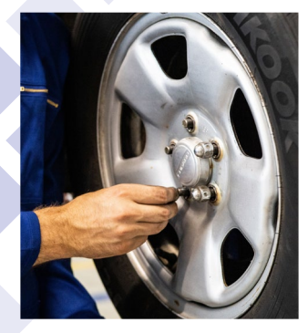
We supply tyres, repair kits, workshop tools, wheel rims and batteries for light and heavy duty vehicles