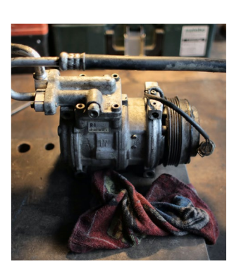
We supply machineries and equipment such as air compressors, balancing machine and electrical components